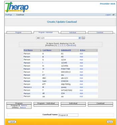
Assign user privilege using CaseLoad

CaseLoad makes this process more efficient in that it can be defined to include one or more individuals enrolled in one or several programs. By assigning privileges to CaseLoads, you are able to restrict permissions down to a single individual. Not only does this make the process easier, this increases the system efficiency.