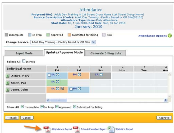
Figure: Billing from Attendance

Medical or behavioral issues that are recorded at home or at work can now be shared in an efficient, secure, and HIPAA compliant way with the other supports involved in an individual's life.