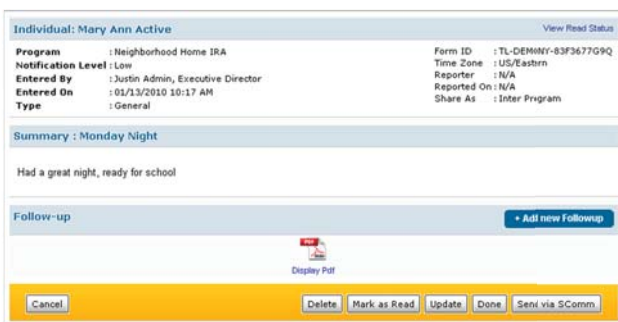
Figure: Therap T-Logs for keeping Daily Notes